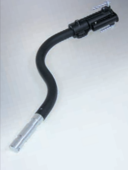
S-yoke (for Nesysflex)