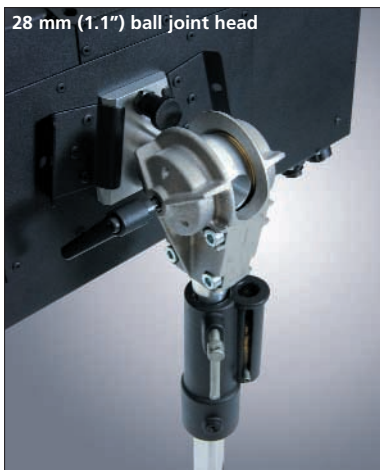
28 mm (1.1") ball joint head