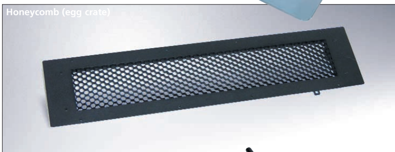
Honeycomb (egg crate)