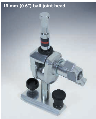
16 mm (0.6") ball joint head