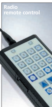
Radio remote control